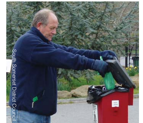
South Somerset District Council

Recent research shows dog fouling is considered to be a serious problem by people living and visiting Somerset.