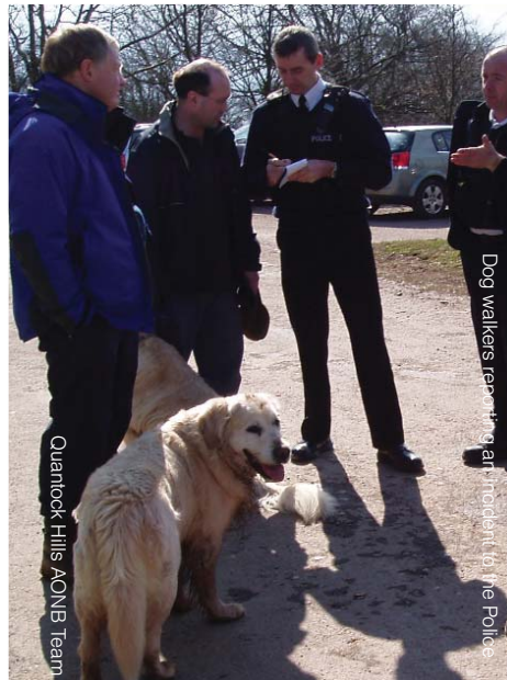
Quantock Hills AONB Team

It is an offence to allow your dog to worry or attack livestock. As a last resort, a person is legally entitled to shoot a dog if they can't stop it chasing or worrying their livestock.