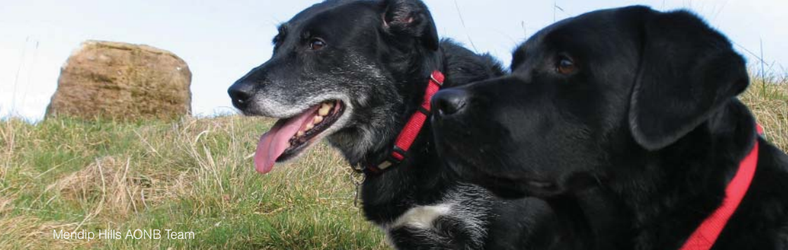
Mendip Hills AONB Team