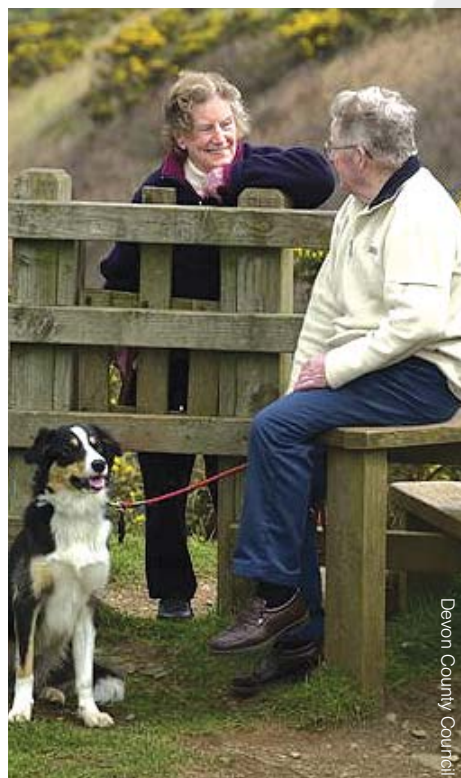
Devon County Council

Many of Somerset's public rights of way cross fields used by farmers to grow crops or graze their animals. On the whole, they welcome people walking their dogs on these rights of way so long as they are kept under close control and their owners clear up after them. Unfortunately though, we often receive complaints about irresponsible dog owners that have not cleared up after their dog and let them chase farm animals and wildlife or damage crops.