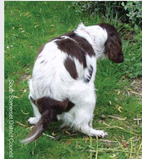
South Somerset District Council

Yes it is. The UK's dog population excretes roughly 10,00 tonnes of poo a week. That's enough to fill four Olympic sized swimming pools!