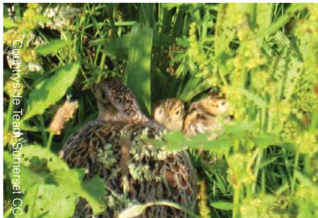
Countyside Team, Somerset CC

Yes. Dogs running loose off a public rights of way can disturb wild animals and ground nesting birds. During the nesting season between April and July keep your dog close to you or on a lead, especially if you're walking across moorland and fields, through forests and woodland or along the edges of fields or shores. If your dog is running loose and out of sight off a path, it could accidentally damage a nest, trample fledglings or scare off their parents leaving the young birds to starve. If you come across a nest, please don't let your dog disturb it.