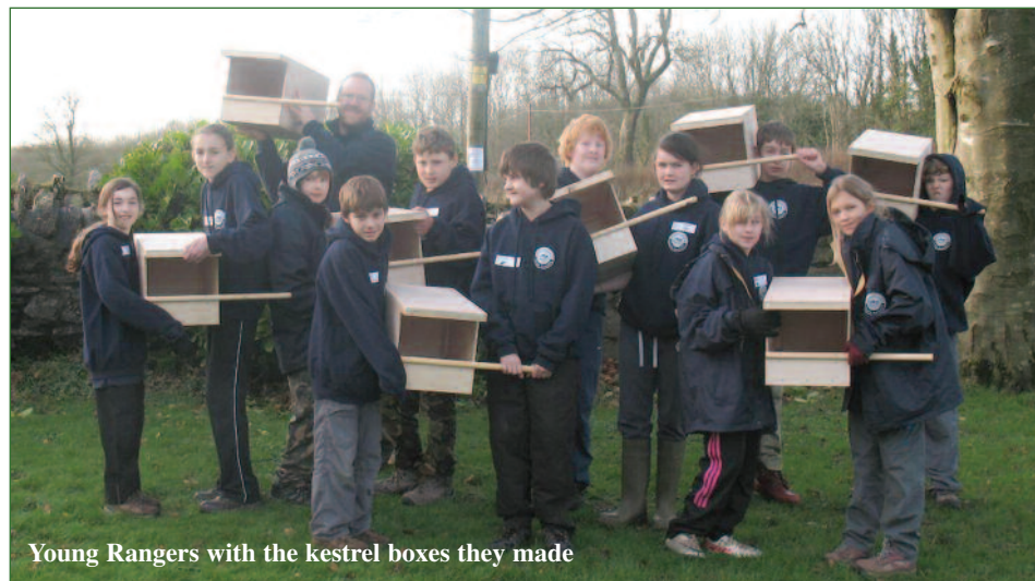
Young Rangers with the kestrel boxes they made

In January AONB Young Rangers assisted the Hawk and Owl Trust's Mendip Raptor Project. The group made 8 Kestrel boxes that will be installed at a site in the AONB next month. The Young Rangers also took part in a raptor survey led by Chris Sperring of the Hawk and Owl Trust observing 4 short-eared owls flying low as they hunted for food over rough grassland – a sign the area is supporting a good population of rodents as food supply for owls and other raptors.