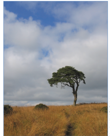
Mendip Hills AONB Unit